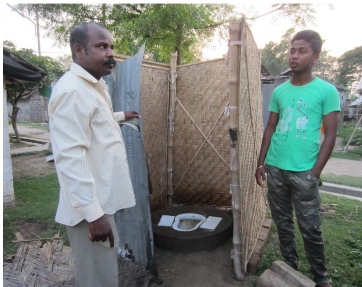
Natural Leaders showing us a toilet built in 2006 at Harijan Para.

With the implementation of CLTS and through its process of self-analysis and self-realisation, the community not only became ODF, but was also instrumental in making the whole of Kalyani ODF. The community realised that with just an ordinary pan, a pit and a water seal that prevents visibility of excreta, foul smell, access to insects/animals and the spread of faecal-oral contamination, low-cost toilets could be constructed at a nominal cost of just 250–300 rupees (under US$5). 11 Some of the community members emerged as Natural Leaders, who took the initiative to guide and support all families in their community to construct toilets and become ODF.