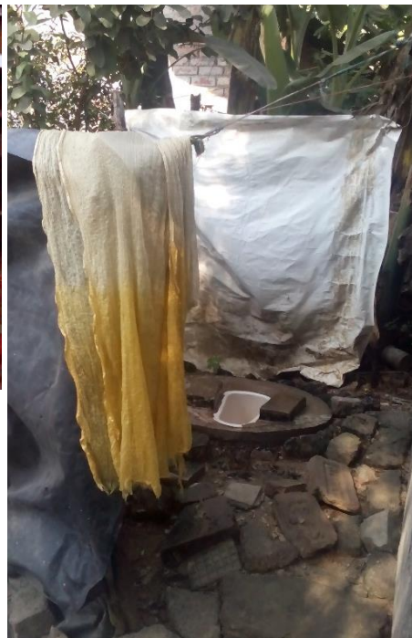
A basic toilet built in 2006 (yet to be upgraded).