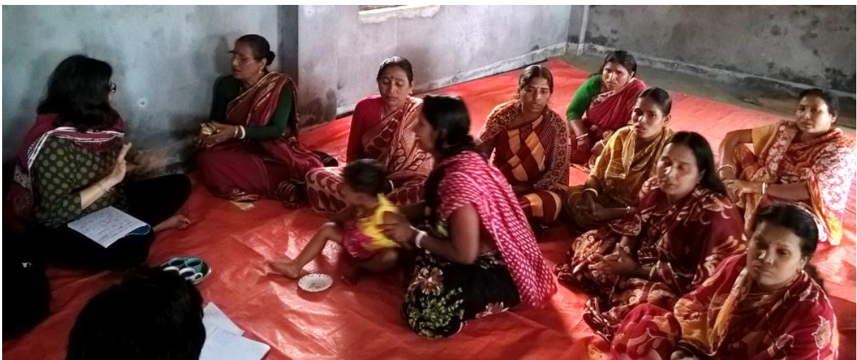
The Self-Help Group in Vidyasagar Colony in conversation with the study team.

Once my elder son was admitted in the hospital due to diarrhoea and I had to stay with him at the hospital for three days. After I brought him home, we continued with the practice of open defecation. At that time no one, not even the doctors, had told us that diarrhoea was being caused due to contamination from open defecation. They just gave us the medicines and treated us. After a few days, my younger son fell ill with diarrhoea. And we had to run with him to the doctor again. I wish we had known why toilets are so important before the CLTS exercise. Now we have a toilet and my children do not suffer from diarrhoea.