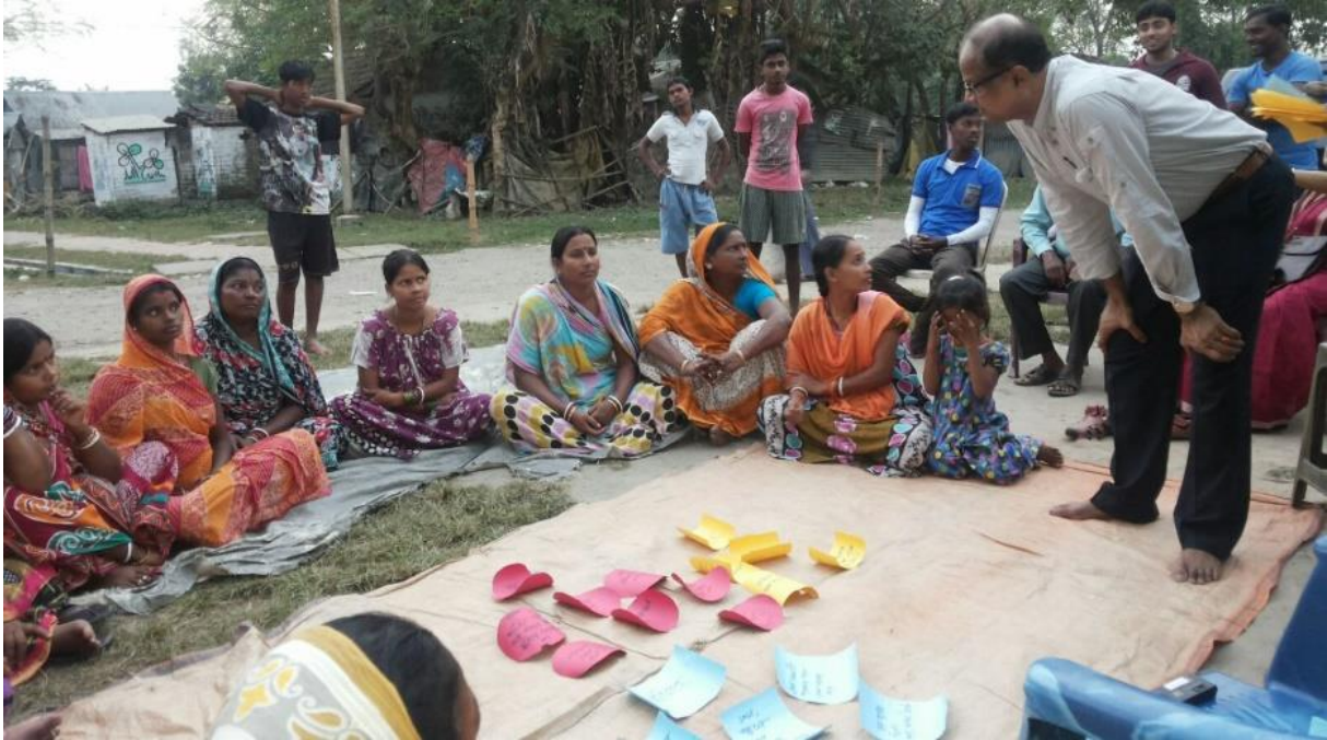
Participatory exercise with women in Harijan Para.

A lady from Vidyasagar Colony (married, mid-30s) narrated her harrowing experience with diarrhoea: