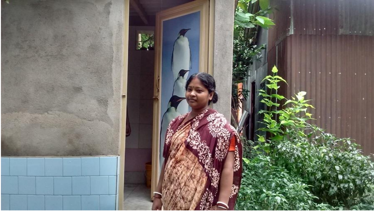
An upgraded 'pukka' toilet in Vidyasagar Colony.