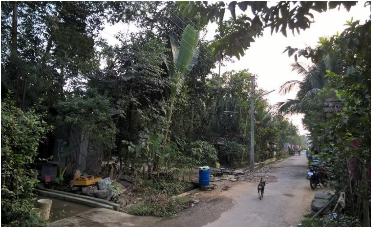
Plot layout at Vidyasagar Colony.

People in Vidyasagar Colony are mostly Hindu refugees and forced migrants from Bangladesh, erstwhile East Pakistan. Many do not have legal entitlement to their land. The locals are enterprising young small business owners and the women in this community were very vocal during the interactions. For livelihood activities, some women are involved in selling puchkas or puffed rice in local trains or on the roadside while the others work as domestic maids or as staff members in the nearby university or offices. Most of the residents have been living here for more than four decades. Many of them are now legal residents or are in the process of becoming one. Without a legal status of citizenship, investing in creating a pukka house or a toilet becomes a big risk owing to the fear of eviction. However, despite the lack of acceptance as legal citizens, each person interviewed agreed that they had found a better life for themselves in this colony.