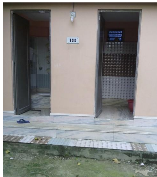
An upgraded 'pukka' toilet in Vidyasagar Colony.

CLTS was introduced in the Kalyani slums in 2006 as part of the Community-led Health Initiative (CLHI) pilot programme under the KUSP project funded by DFID. This was the first time in India that a community-driven approach was adapted within any urban sanitation project. Until then, all the urban sanitation campaigns in India had been driven by a top-down infrastructure-oriented approach that focused on either providing subsidies or constructing toilets as a means to end open defecation (Jewitt 2011). As a result, not only did entire settlements become ODF in Kalyani, but it also emerged as a replicable example for successful urban CLTS (and sanitation) for thousands of Municipalities in the country. Kalyani soon served as a learning laboratory for sanitation initiatives not just in India but also in other countries in the world and has been documented as a case study for discussions on urban sanitation and development. It must be stated that part of the success in Kalyani may be due to the fact that the settlement pattern in Kalyani is not as dense as in most inner city urban slums. It instead resembles a peri-urban location with more space to construct toilets.