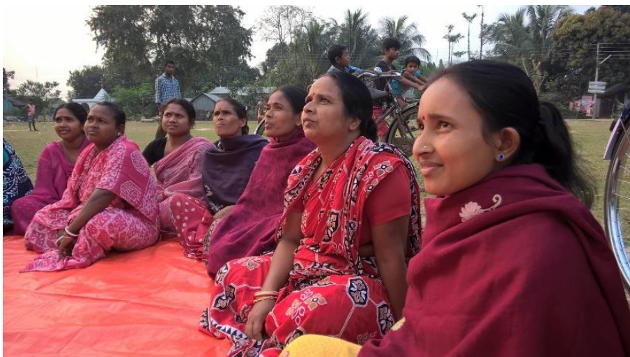
Women participating at an FGD in Vidyasagar Colony.

A combination of methods were employed by the research team during the investigation to collect data related to the study objectives. Focus group discussions (FGDs) were held with women separately in the two slums in different periods. In both the slums, two FGDs were held with a large group of women. Each FGD was attended by 40–50 women.