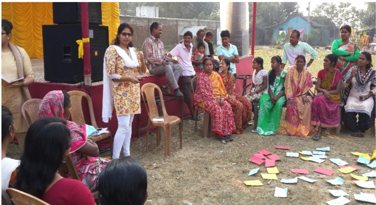
An interaction with women in Vidyasagar Colony.

All of the above can be summarised in Cecilia Sardenberg's (2009) approach to conceptualising empowerment, which she describes as 'liberal vs liberating' empowerment. Thus while liberal empowerment focuses on engaging women to make economic, social and political changes in their lives which would help them gain more power in their daily lives, liberating empowerment pertains to power accruing to women through collectivisation and changing the status quo, i.e. the social and gender norms and structural inequalities that exist in society ( ibid. ).