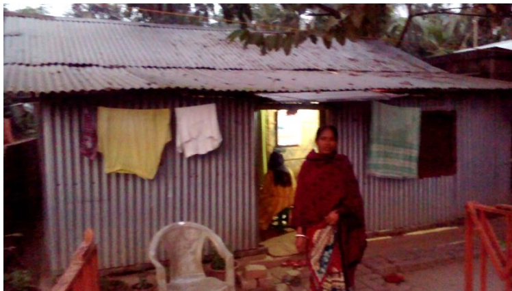
A 'kuccha' house in Vidyasagar Colony.