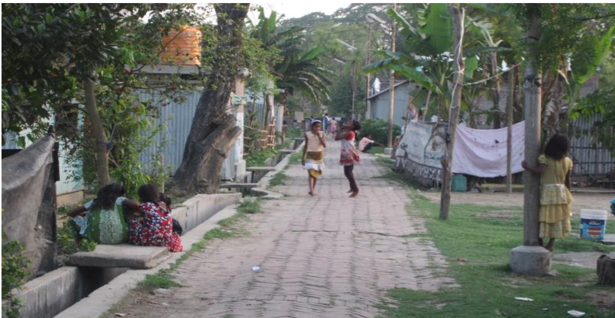
Harijan Para.