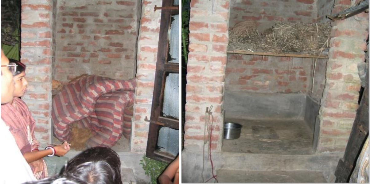
The fate of toilets earlier provided under government programmes.