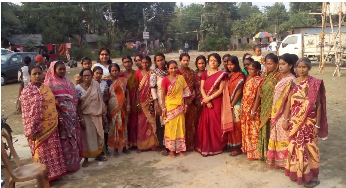
The study team with the change-makers of Vidyasagar Colony.

A woman said, 'We have our differences but when it comes to the development of the community there is a lot of unity between us.' Access to basic services has enhanced the lives of people in the community and expanded the scope and ease of their activities.