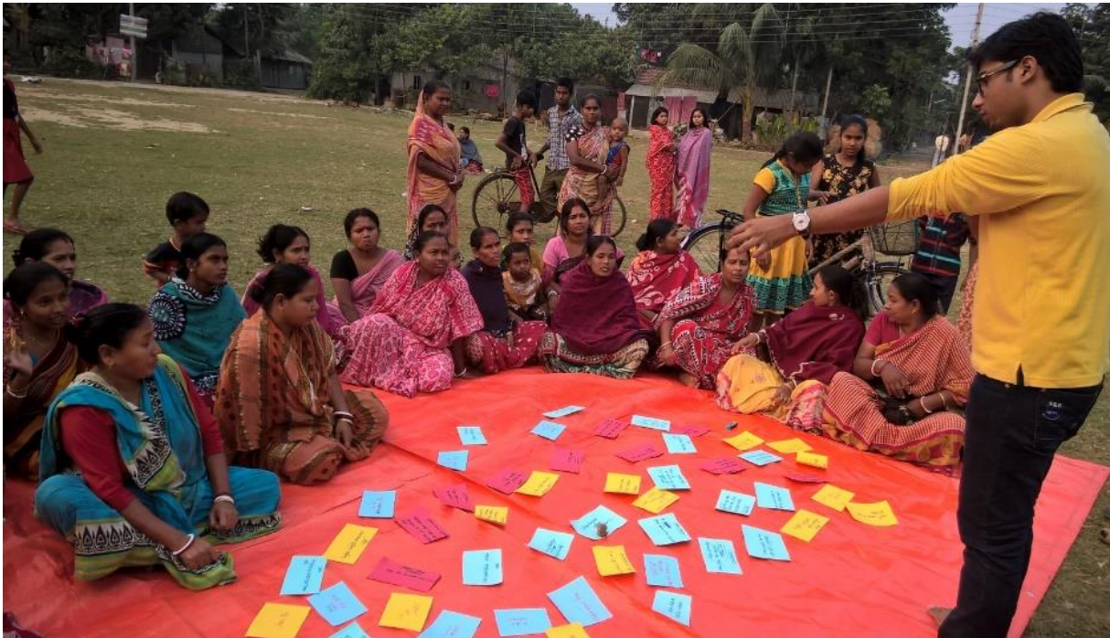
Participatory exercises with women at Vidyasagar Colony.

Since the women have not had to go out to the fields to defecate, they have gained a lot more time in their daily lives.